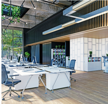
Benefits of Commercial Renovations