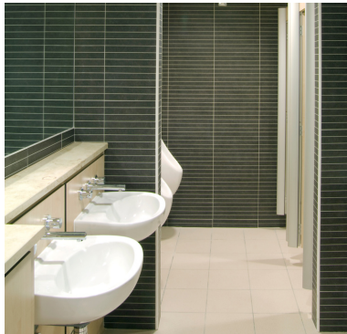
Common Types of Renovations